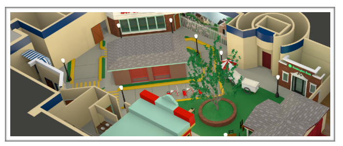
Weinberg Village, Michigan, USA Special needs village