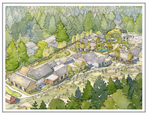
The Village, Langley, B.C. Canada's first dementia village